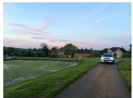
Rural patrols in Warmington earlier this week

If there are more than 3 suggestions then there will be public voting on our website for 2 weeks prior to the Community Forum, as well as voting at the forum itself. Previous priorities have included matters such as traffic concerns, patrols in relation to recent crime patterns or anti social behaviour etc